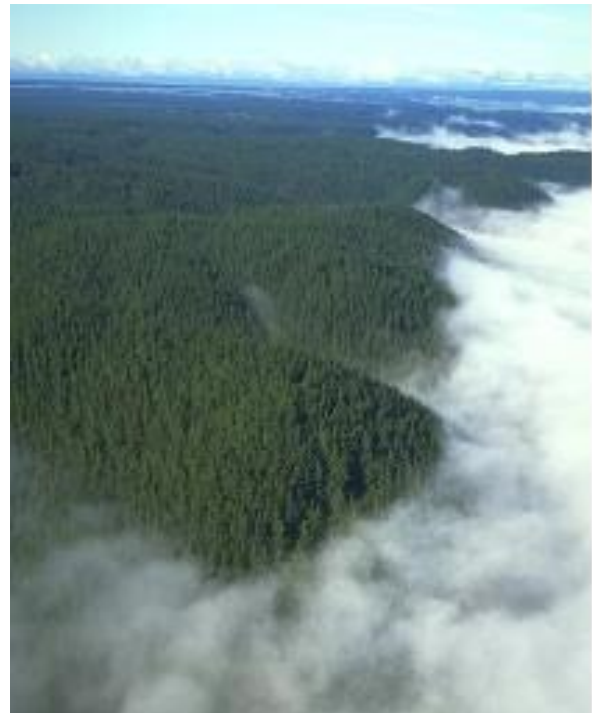
Purpose grown Radiata Pine forest – New Zealand

So rounding back to the original question of what is acetylation? Technically it's a chemical process. But we could say that acetylation is an opportunity for peace of mind, to invest in our homes and protect our planet.